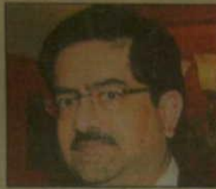
Kumar Mangalam Birla , chairman of Aditya Birla Group, has been nominated as the chairperson of IIT Delhi